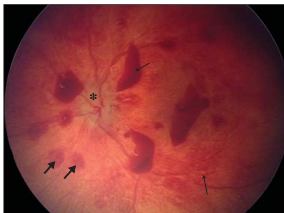
Figure 2. Posterior pole of the left eye and extending into the midperiphery of the retina (at edges of image) of an infant with abusive head trauma. Image shows optic nerve (asterisk), a preretinal hemorrhage (note how it lies over a retinal vessel) (short arrows), and flame hemorrhage with characteristic linear appearance (long arrows).

The hypothesis that increased intracranial pressure (ICP) can induce extensive retinal bleeding has recently been promulgated largely in the courtroom. 20,21 Elevated ICP is