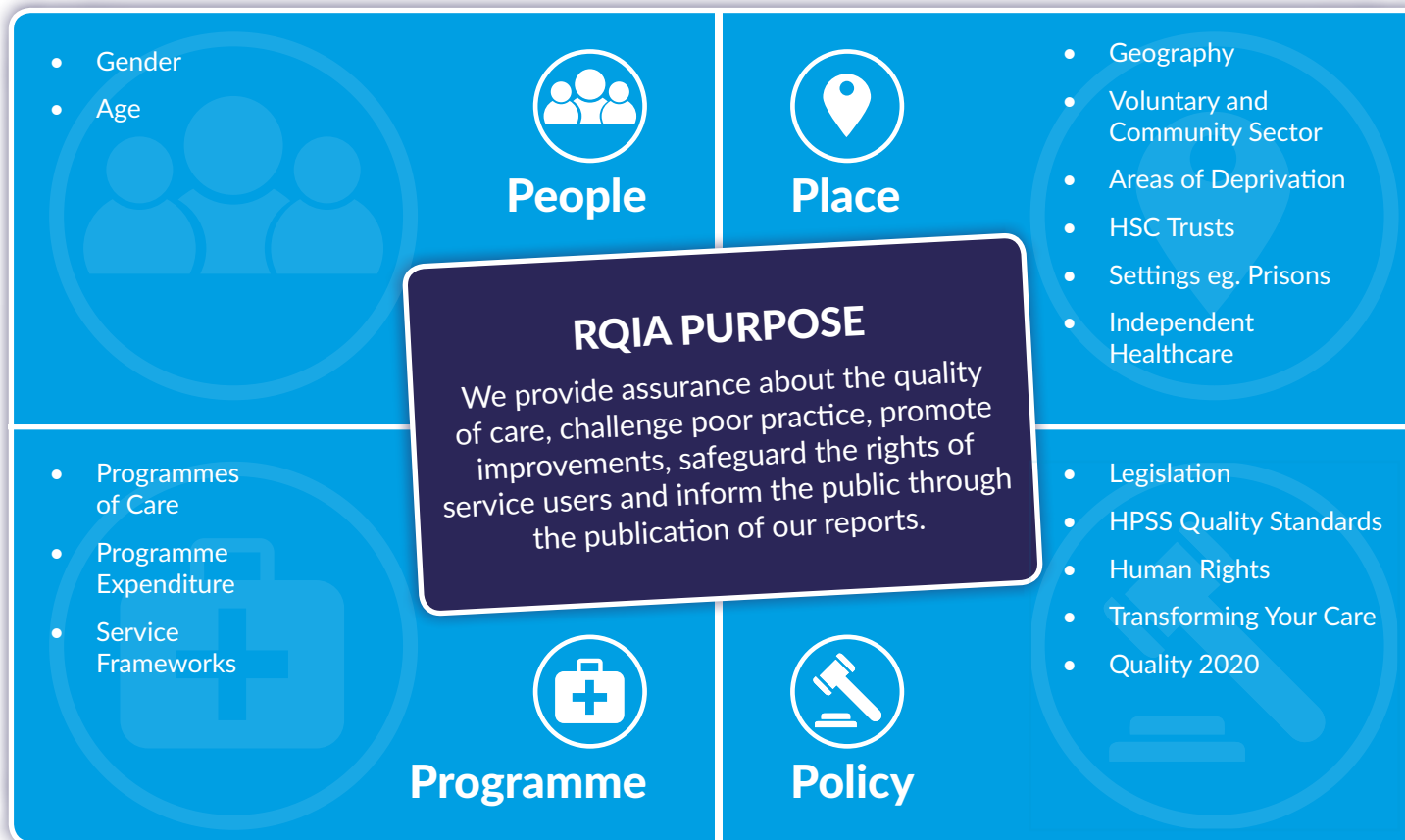
Figure 3: Balancing the Review Programme